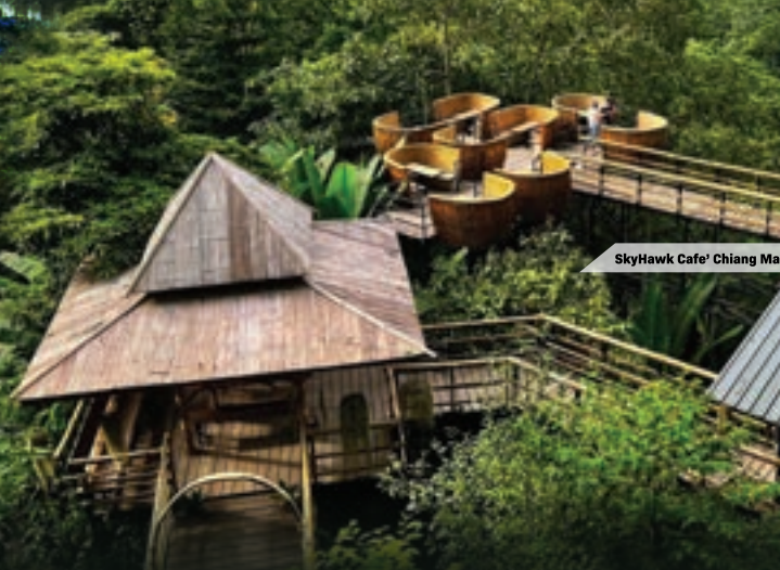
SkyHawk Cafe' Chiang Mai

enjoy beautiful views, experience nature, discover true adventure!